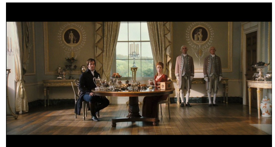
The room from Lizzie's perspective ( Pride & Prejudice 2005: 0:18:05)

Initially, the static camera is situated behind Miss Bingley and Mr. Darcy. As the characters turn their backs on the audience, they do not capture the viewer's attention. Instead, the viewer is free to admire the room, which is spacious and pastel-coloured. The silverware on the table, the screen in the background and the crystal candelabra on the left and right are all at least as admirable as they are useful. The paintings behind the two characters' heads and the marble columns remind of neoclassicism and are thus readily associated with superiority (of taste, education and achievement). This feeling of superiority is later indirectly reaffirmed by Miss Bingley who comments that Lizzie looks "positively medieval" ( Pride & Prejudice 2005: 0:18:40). Contrasted with the neoclassicism of the room, this is certainly no compliment, as neoclassicism coincided with the Age of Enlightenment and thus clearly favoured ancient classics over the Middle Ages.