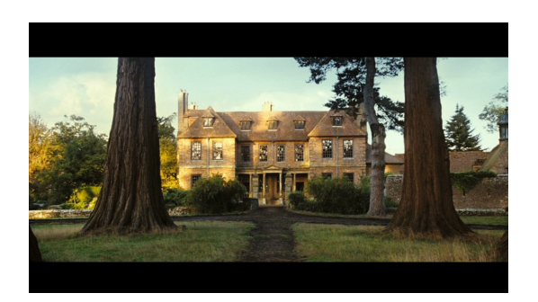
Longbourn, the Bennets' home ( Pride & Prejudice 2005: 0:04:57)

The introductory sequence ends with a long shot of Longbourn's front. The camera zooms out gradually, revealing the surroundings of the house and distancing from the family home. The shot lasts twenty seconds and is thus long enough for the audience to reflect on the former sequence and memorise the idyllic picture of the house. This shot, as well as numerous others, feels relatively long and thus slows down the narrative drive of the film. This is one of the aspects differentiating this British heritage film from mainstream Hollywood products.