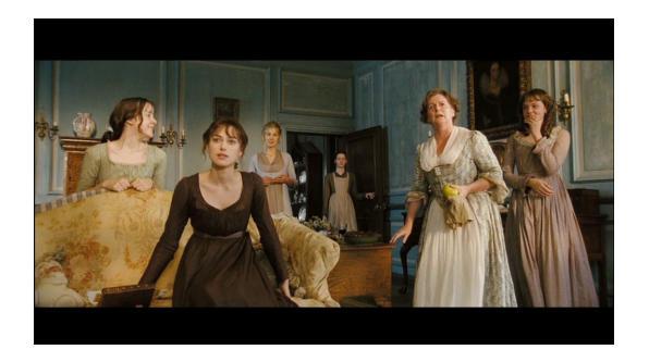
All female Bennets in their parlour ( Pride & Prejudice 2005: 0:03:50)

The screenshot above shows all female Bennets in their parlour, quizzing Mr. Bennet about their new neighbours. At this point in the film, all family members have been introduced and the film's central theme, finding the right spouse, moves centre stage. The room is more representative than the dining room but the characters, not the room, retain the viewer's attention. The six female Bennets are arranged in the front, middle, back, left and right of the frame. Their positions are indicative of their relationships to each other and their importance in the film. On the whole, the narrative function of this scene greatly surpasses its value in displaying the material riches of an upper-class family.