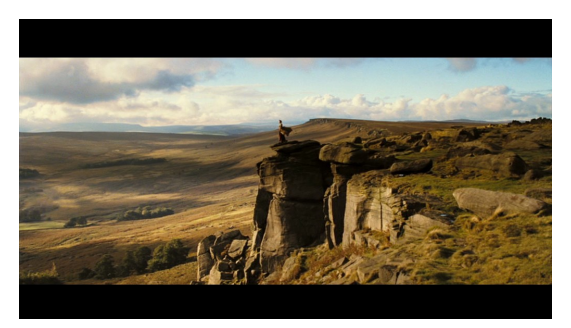
Lizzie on holiday with her aunt and uncle ( Pride & Prejudice 2005: 1:17:17)