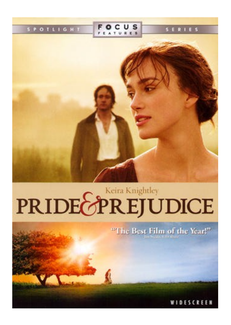
The US-American DVD cover of Pride & Prejudice (2005)