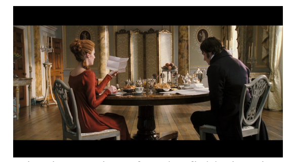
First impression of Netherfield's interior ( Pride & Prejudice 2005: 0:17:43)

The depictions of Netherfield and Pemberley differ from Longbourn both in miseen-scène and cinematography. This becomes apparent in the very first impression of Netherfield's interior. The display of the room is given preference over characters.