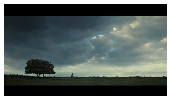
Lizzie on the way to Netherfield ( Pride & Prejudice 2005: 0:17:38)

There are four different scenes in which Lizzie is shown in extreme long shots, surrounded by England's vast countryside. They represent the film's most memorable type of display of landscape and according to Sarah Ailwood, these countrysides also support the identification of Lizzie and Mr. Darcy as Romantic heroes (cf. Ailwood 2007). The lengths of these scenes varies from five to thirty-one seconds, although all of the scenes in which Lizzie walks are less than ten seconds long. Apart from Mr. Darcy in the final proposal scene, Lizzie is the only character displayed in such a way. Indeed, Lizzie is hardly visible in these shots. Be it through the earthly colour of her dress or the lighting, she fits in with the surrounding environments. Lizzie purposefully moves in three of the shots and the scenes thus carry the narrative meaning of changing place. However, the extreme long shots suggest that Lizzie is not the most important aspect of these scenes. Rather, England's countryside is the main protagonist.