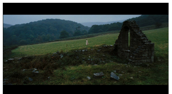
Lizzie walks away from Pemberley ( Pride & Prejudice 2005: 1:25:08)

In the three walking scenes, it either rains or the sky is full of clouds. The weather is uninviting and still we know that it is Lizzie's free choice to be outside. These scenes confirm the cliché of England's bad weather while simultaneously showing that this is not necessarily bad. Lizzie's blending in with the surrounding environment can be interpreted as her good relationship with nature. If the viewer identifies with Lizzie, it can also indicate that mankind is one with nature, that we are part of it.