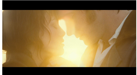
Lizzie and Mr. Darcy almost kiss after they have agreed to marry ( Pride & Prejudice 2005: 1:52:52)